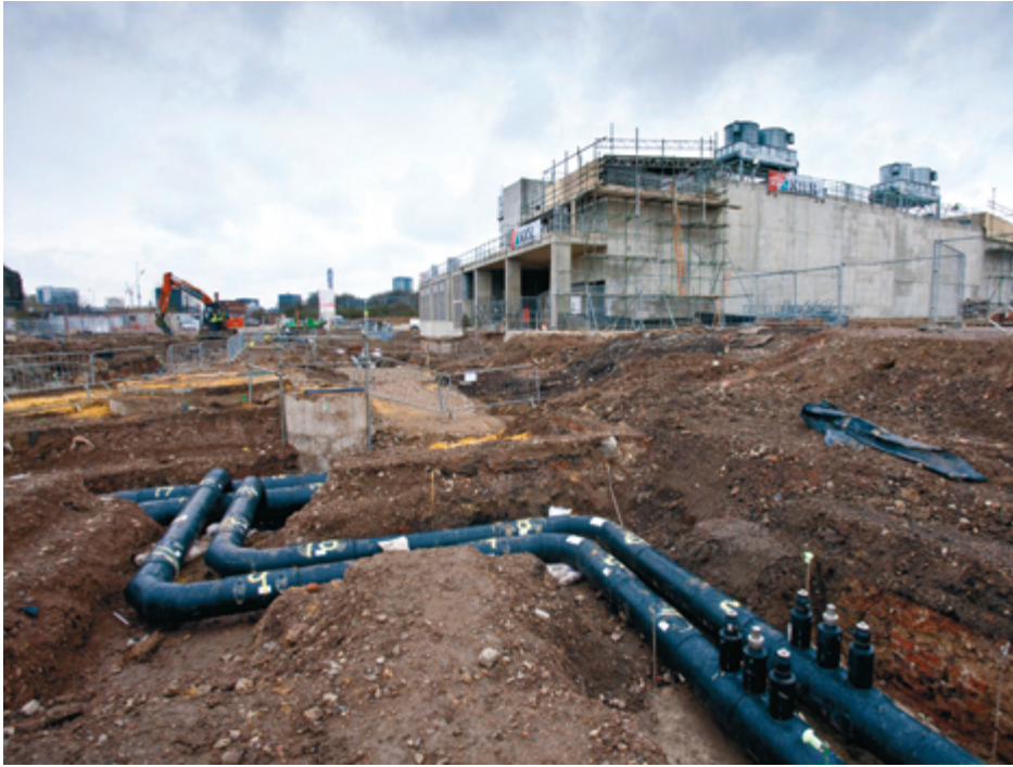
Utilities being connected into the Energy Centre

The King's Cross Energy Centre and Primary Electrical Substation shell works are now complete, and the six month fit-out of plant by the various utility contractors involved in the project is now well progressed. On completion, the works will constitute the first step in a planned phased installation of plant to serve the development as it grows. Kier will remain in place as Principal Contractor for the duration of the first phase of works. Installation of below ground utilities in the Eastern Goods Yard is almost complete and the final connection to the Energy Centre is being made in preparation for the commissioning works to the UAL campus during the third quarter of 2010.