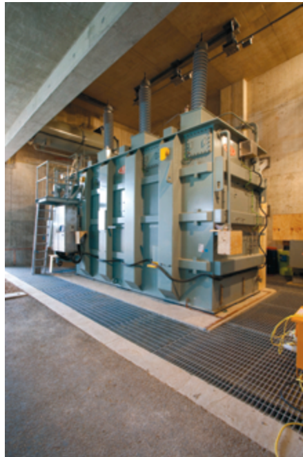
Above and below: Installation of plant at the Energy Centre

The King's Cross Energy Centre and Primary Electrical Substation shell works are now complete, and the six month fit-out of plant by the various utility contractors involved in the project is now well progressed. On completion, the works will constitute the first step in a planned phased installation of plant to serve the development as it grows. Kier will remain in place as Principal Contractor for the duration of the first phase of works. Installation of below ground utilities in the Eastern Goods Yard is almost complete and the final connection to the Energy Centre is being made in preparation for the commissioning works to the UAL campus during the third quarter of 2010.