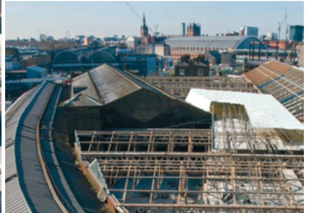
Restoration of West Handyside Canopy