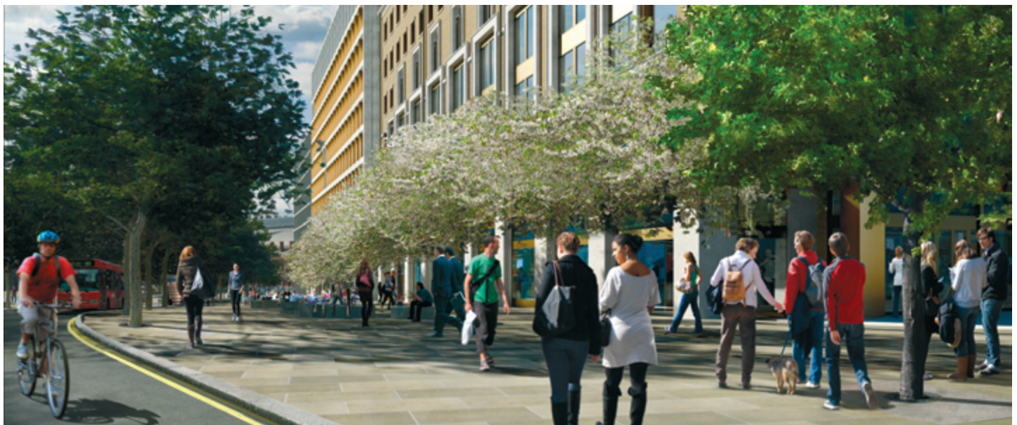
Artist's impression of the Boulevard once Buildings B2, B4 and B6 are complete

These initial works involve the construction of a generous 10m wide route rising gently from Pancras Road in the south to Goods Way in the north, with a row of London Plane trees along its east side. The final completed Boulevard will provide a two-way vehicular route for buses and taxis and will have generous tree-lined pedestrian spaces to either side.