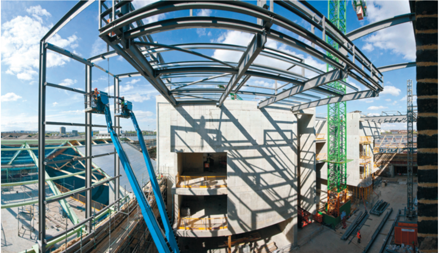
New covered public east-west link being constructed behind the Granary