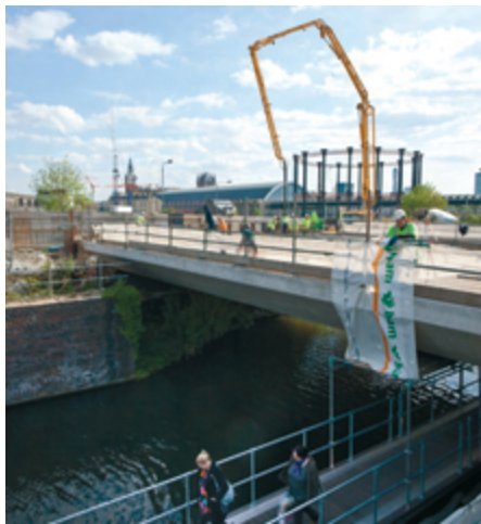
Above and below: new bridge under construction