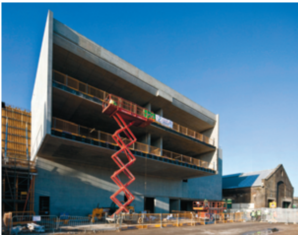
The new purpose-built 300 seater performance theatre and rehearsal space for the UAL

On top of the studio areas, application of the 'hydrotech' waterproofing finish is now complete and the insulation and lining installed. The main roof plant, including air handling units and mechanical pipe work, is also in place.