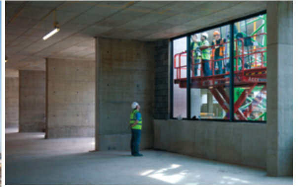
Glazing installation within the studio spaces