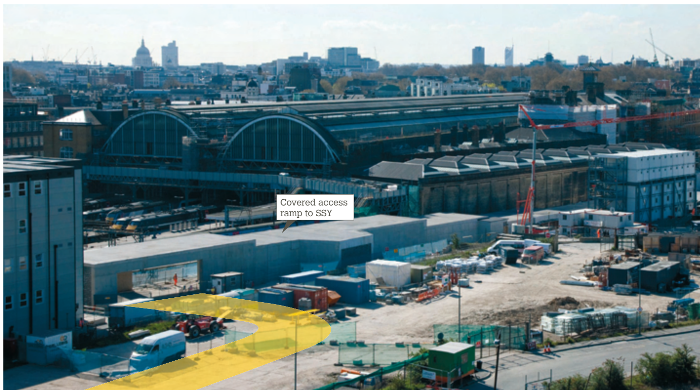
View to King's Cross Station with approximate position of the Interim Service Road