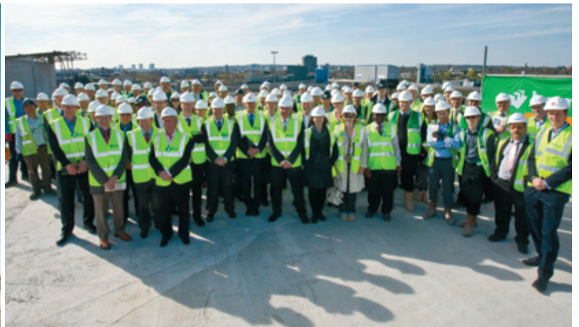
'Topping out' ceremony