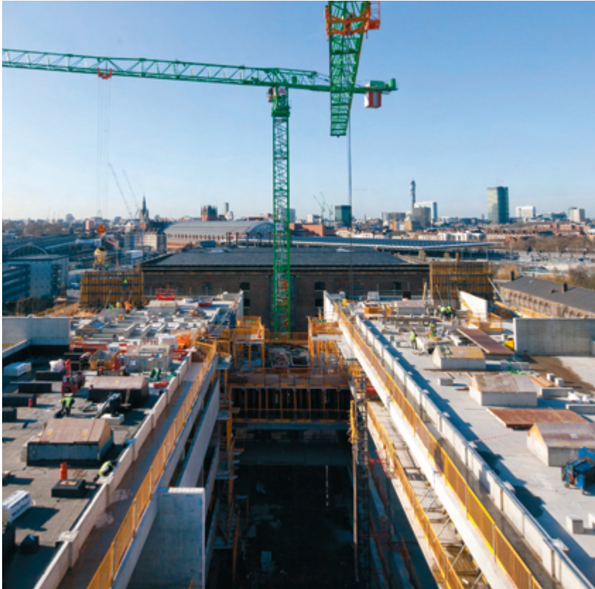
Studio spaces and the central walkway for the UAL