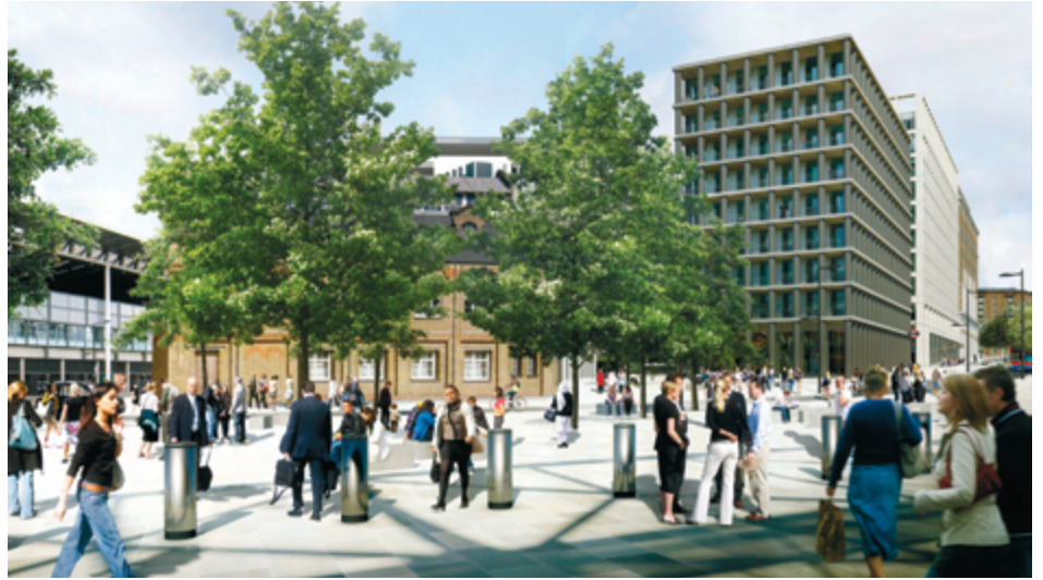
Artist's impression of Station Square once Buildings B2, B4 and B6 are complete

Detailed designs have recently been submitted to the London Borough of Camden for Station Square, a new public square between St Pancras International and the new King's Cross Station Western Concourse. This new square sited between the two mainline railway stations will be a focal point of pedestrian activity. The square will be a simple, open space with an informal arrangement of trees. The use of the square as a meeting point will be encouraged through the provision of a series of curved benches.