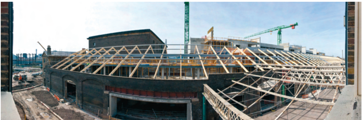
New 'glulam' beams to support the new roof on the Eastern Transit Shed

BAM have commenced shot blasting of the cast iron 'saw-tooth' West Handyside Canopy and a protective barrier has been erected around the northernmost bays. The works will be undertaken along the canopy, starting from the north. The structure is to be shot blasted, repaired and strengthened, and then painted prior to the erection of the new roof covering which will consist of photovoltaic panels to the south facing pitch and glazing to the north facing pitch.