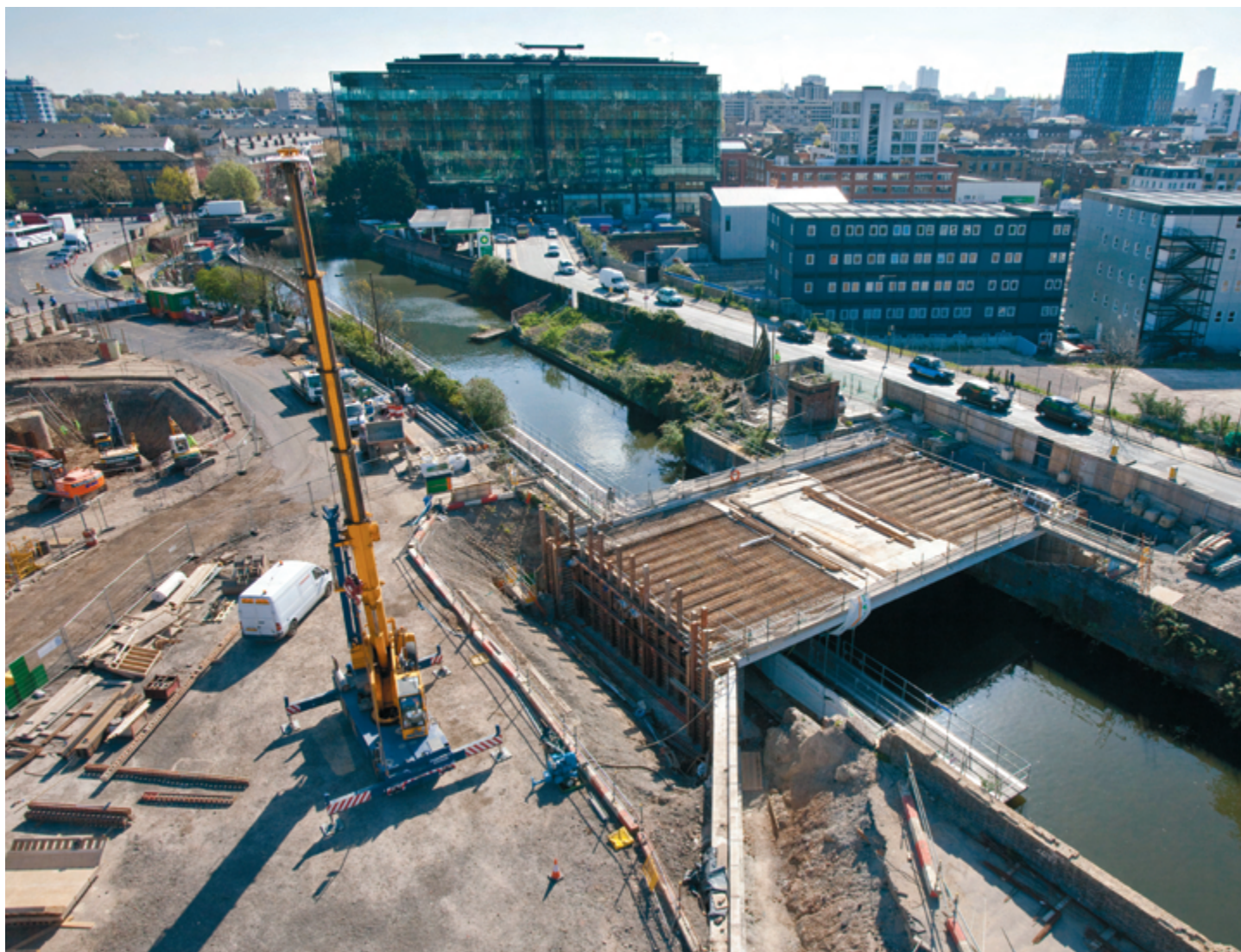
The new vehicular bridge over the Regent's Canal.