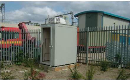
Construction Skills Centre air monitor