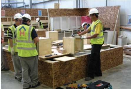
Construction Skills Centre trainees building the furniture