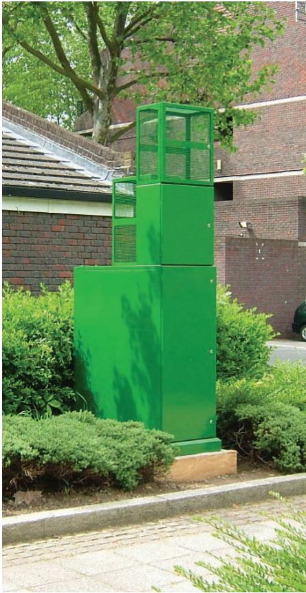
Coopers Lane air monitor

Give and Gain Day Staff from Argent and Carillion recently donated one day of their working week to help enhance a local school’s playground. St. Michael’s Junior School in Camden now has a dedicated outdoor reading garden. This can comfortably seat a whole class, but can also be used by individuals during break times. Building the reading garden represented Argent and Carillion’s contribution to Give and Gain Day, a nationwide day of volunteering organised by Business in the Community. Over 4,000 employees gave up their time to help with projects which benefit their local community. The furniture and planters for the reading garden were built by trainees from the King’s Cross Construction Skills Centre. Several trainees were also on hand to install these. Meanwhile Argent and Carillion staff completed a large mural which depicted characters from the pupils’ favorite stories, including the BFG and Elma the Elephant.