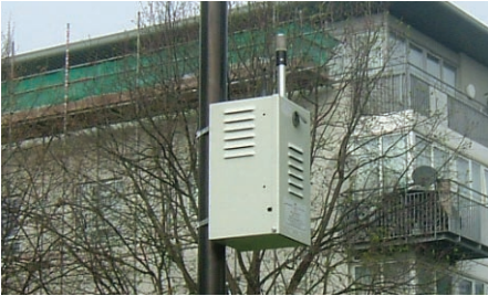
Bingfield Park air monitor

When the amount of dust in the air exceeds a certain level, the control centre sends an automatic alert to the London Borough of Camden and contacts at the construction site. Action is then taken to tackle the source of the dust particles.