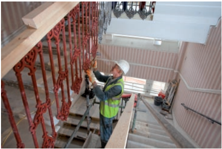
Reinstating cast iron balustrading