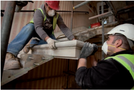
Restored yorkstone stair treads

As part of the Great Northern Hotel arcading works, Kier Wallis have been reinstating one of the original stone staircases which suffered from an insensitively inserted lift during remodelling in the 1920s. The works have involved sub-contractor Priest Restoration machining new stair treads out of yorkstone salvaged from other parts of the building which are then individually dowelled into place. Bespoke templates have also been created in order to reinstate the cast iron balustrading - an item of works being undertaken by sub-contractor Marsh Brothers.