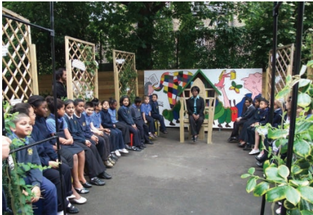
The finished reading garden