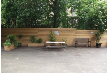
Before the works were started