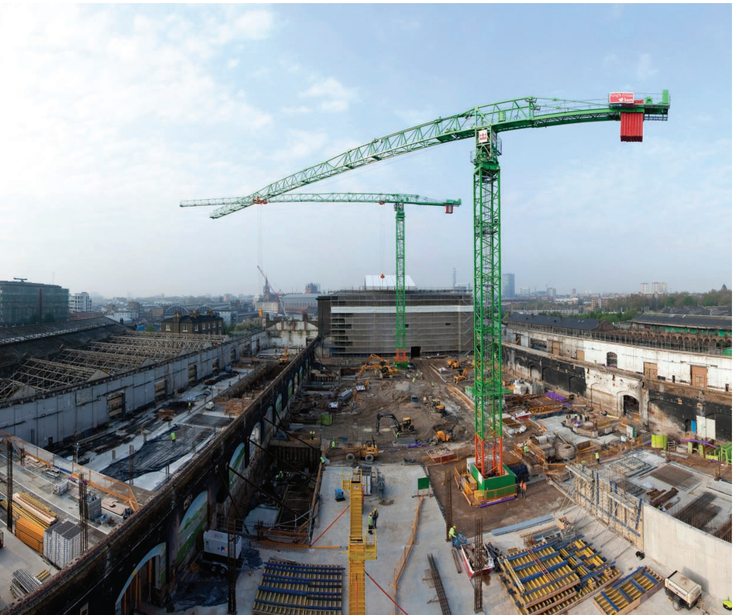
Looking south over construction activity to The Granary and Eastern Transit Shed for the new University of the Arts London campus

Over 40% of this development will be public realm including three new parks, five squares, twenty streets and three new bridges over the Regent's Canal. Much of the area's heritage will be maintained by refurbishing 20 historic buildings and structures, including the listed gasholder triplet.