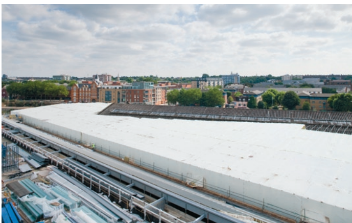
Protection covers the West Handyside Canopy whilst sensitive restoration takes place

In order to facilitate the movement of students and staff between spaces on the eastern and western sides of the street, six concrete and steel 'link' bridges have been constructed on site. Balustrade works to these link bridges have progressed allowing for installation of the timber block covered street flooring works to commence in early November.