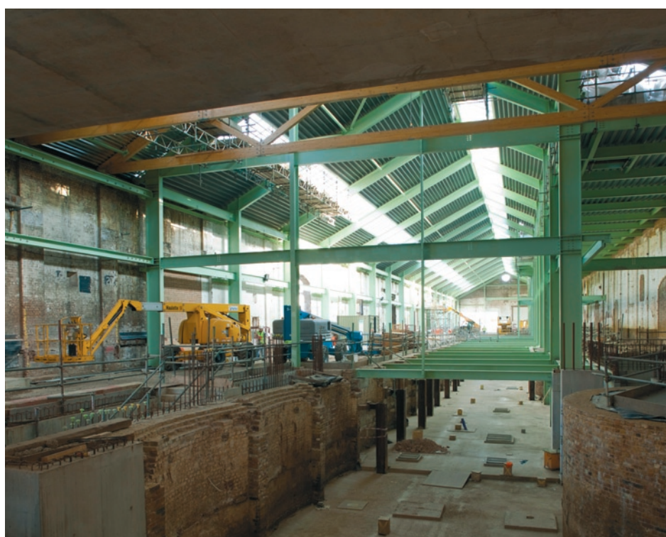
The Western Transit Shed's structural steel framework shows how the ground floor retail units can be divided

The main roof structure has been substantially installed, and the roof lights that sit in the roof pitches and provide light to the interior are being installed.