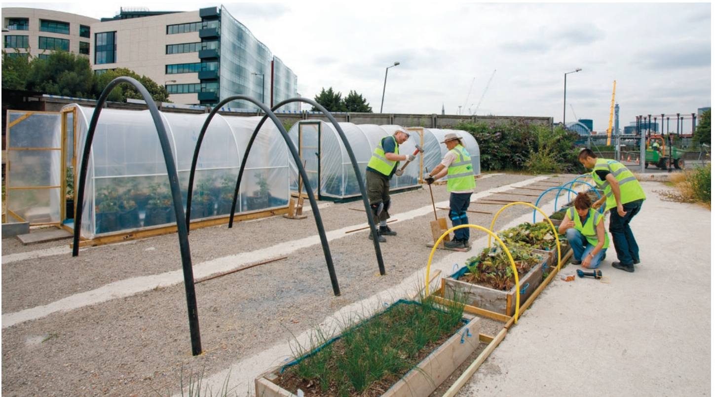
The King's Cross Hoop Garden off York Way

Building on the success of the King's Cross 'Skip Garden', Global Generation and partners have developed the 'Hoop Garden' on the site of the old Construction Training Centre.