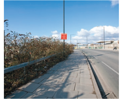
Present day view along site of R4 on York Way

Designed by PRP Architects, Building R4 is being developed after an agreement between One Housing Group and King's Cross Central. That agreement is underpinned by a £42m HCA funding package.