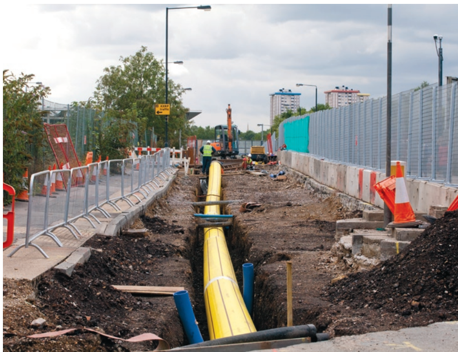
Installing a new gas main along Goods Way's westbound carriageway