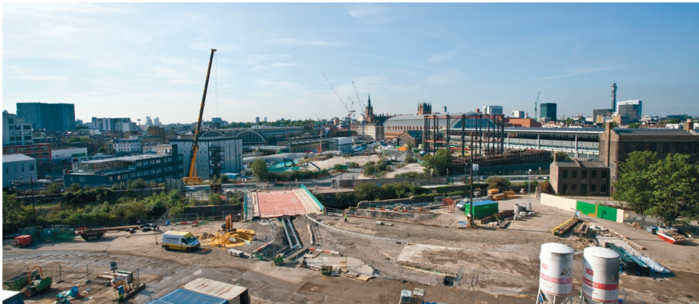
View south over Granary Square towards the new bridge over the Regent's Canal