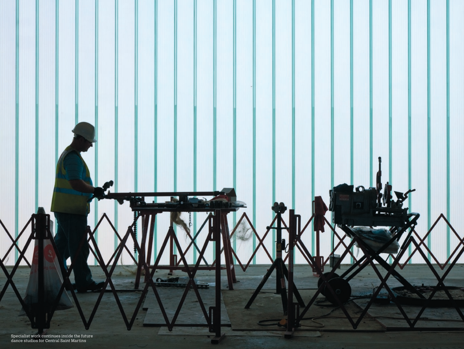
Specialist work continues inside the future dance studios for Central Saint Martins