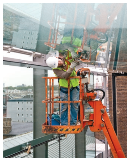
Glazing work in the east-west link

Once complete, the space will be open to the public and used to hold events, launches and exhibitions. Throughout the year the space is also made available to the sole use of the University for their degree shows and numerous exhibitions.