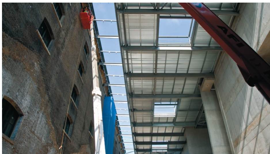
21 metres up in the east-west link

Several attributes to this Cathedral-like space make it a unique area to visit. They include the scarring to the north elevation of the Granary which shows the patina of change and evolution of the space adjacent to this building over that last 150 years.