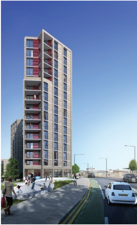
View along York Way once R4 is complete