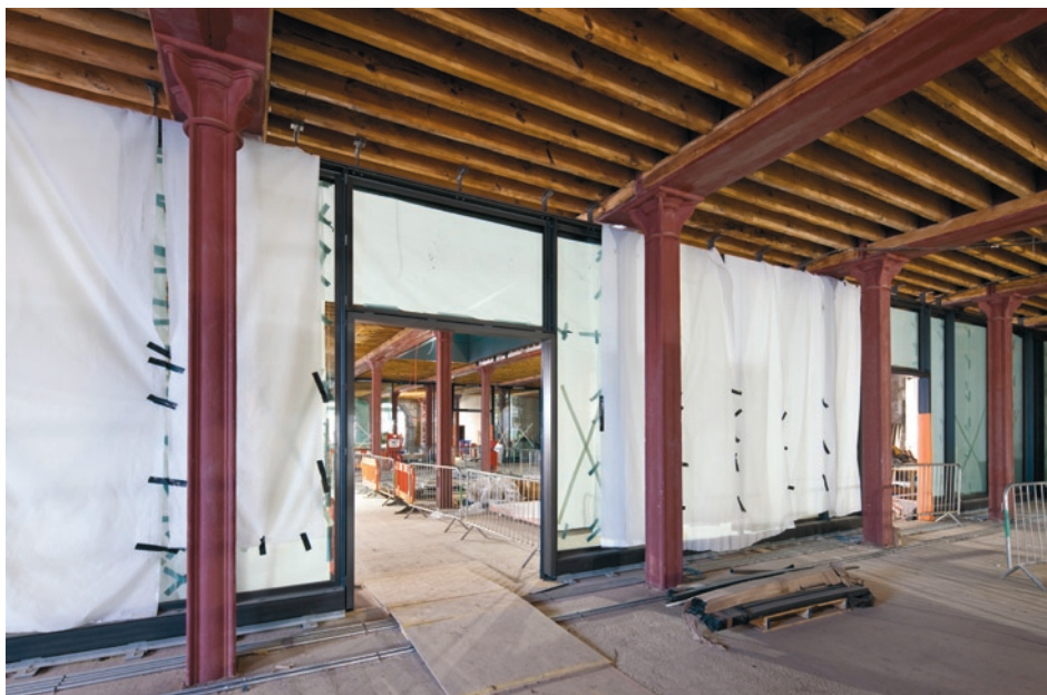
Ground floor reception areas taking shape in The Granary