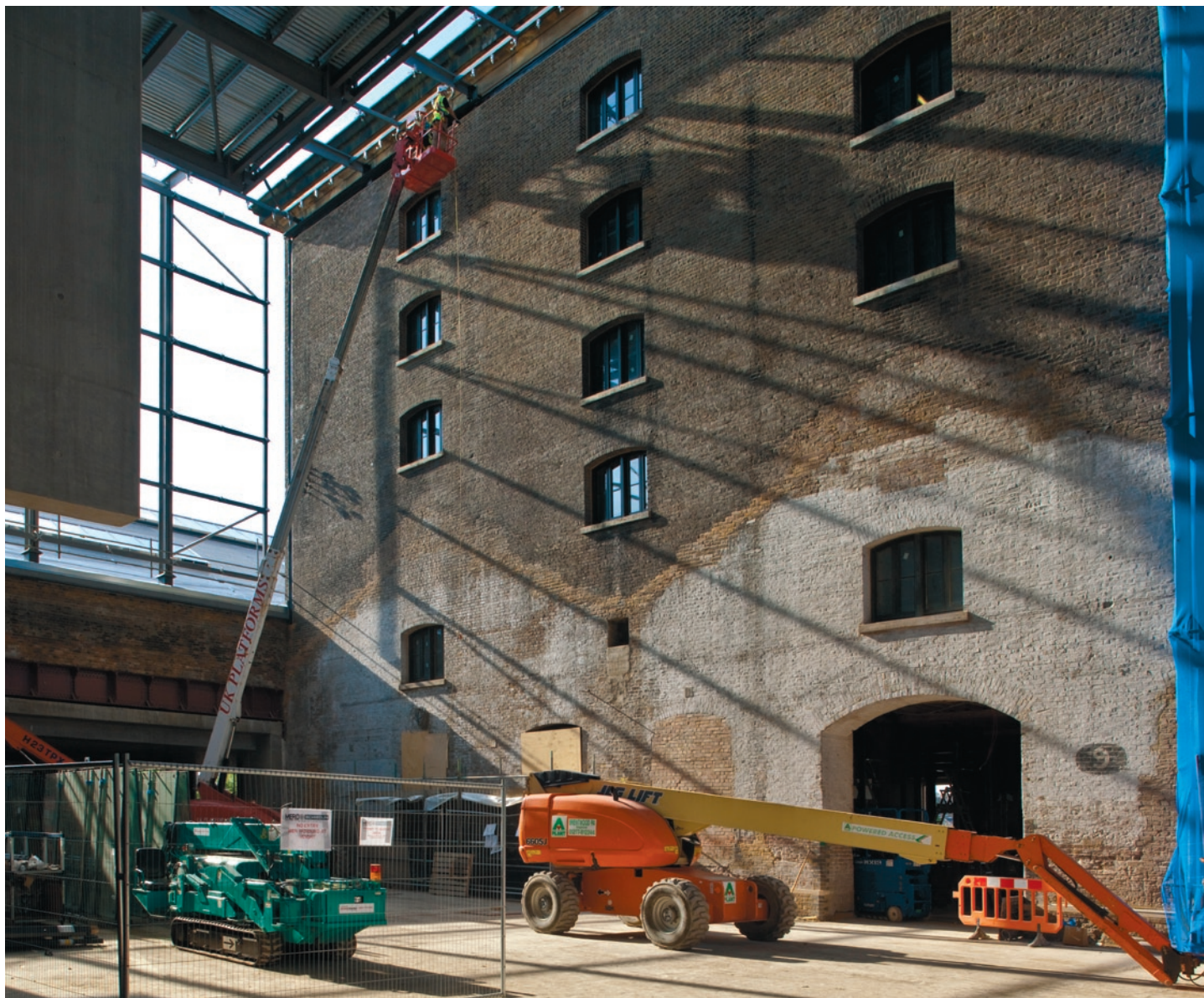
Works to the northern façade of The Granary in the east-west link