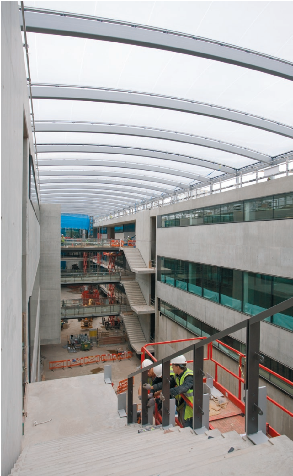
The magnificent central walkway through the University