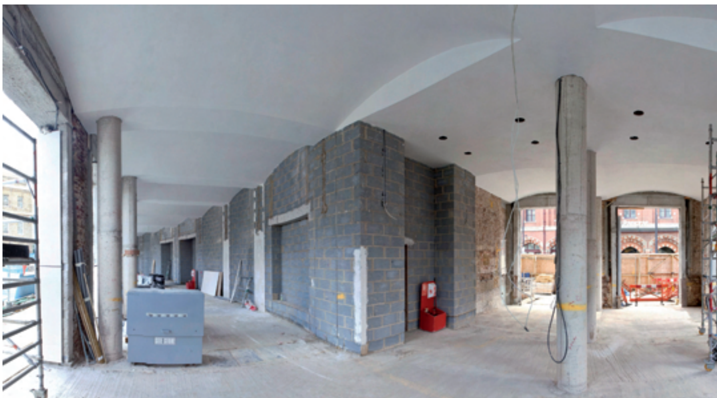
The arcading works that will provide public realm within the Great Northern Hotel