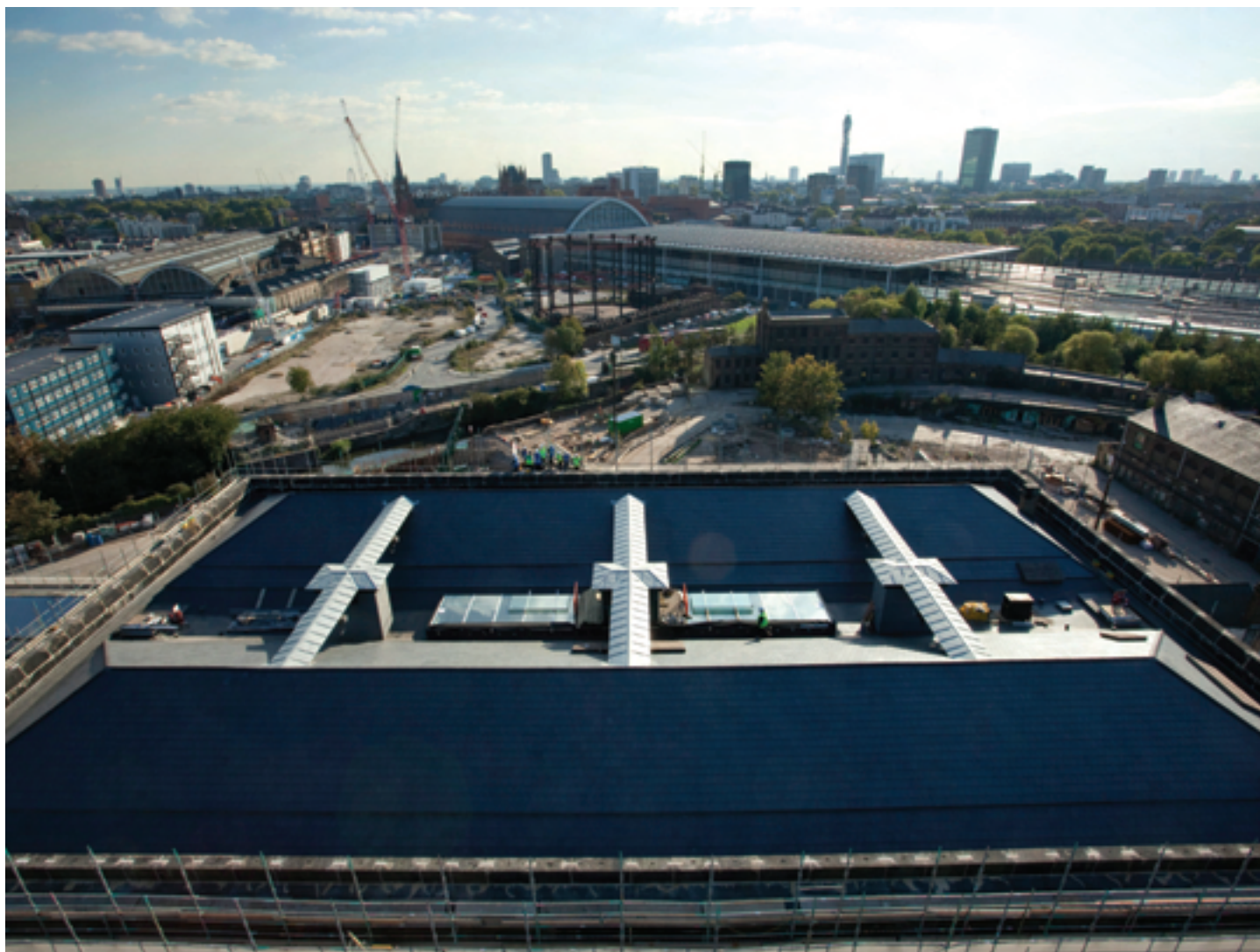
View looking south over The Granary with its restored slate roof and new lightwell

Welcome to the Autumn 2009 edition of the King's Cross Construction News.