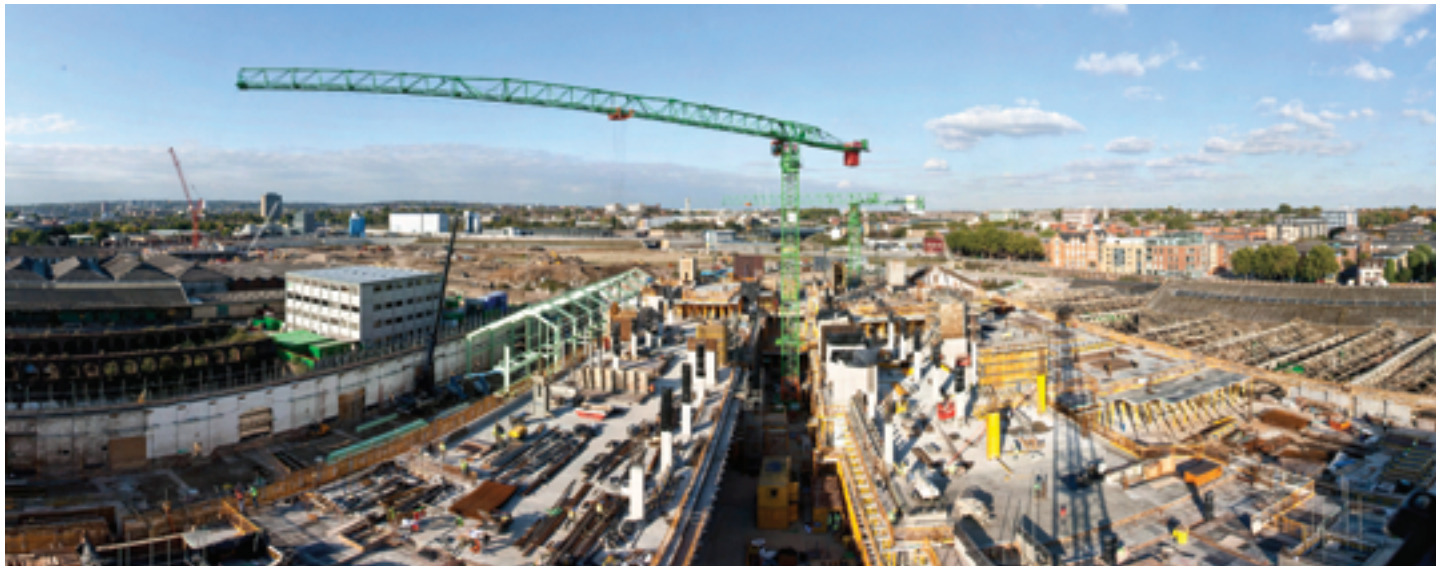
Progress continues to the studio spaces for the University of the Arts London