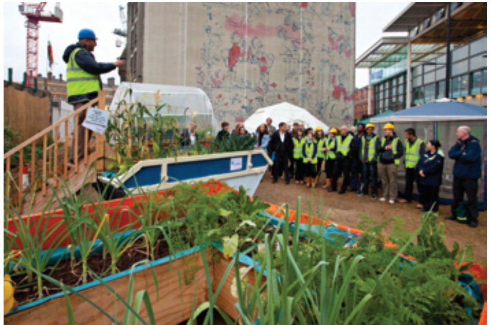
King's Cross Central Skip Garden launch

For more information visit: www.ic-works.co.uk/gg/