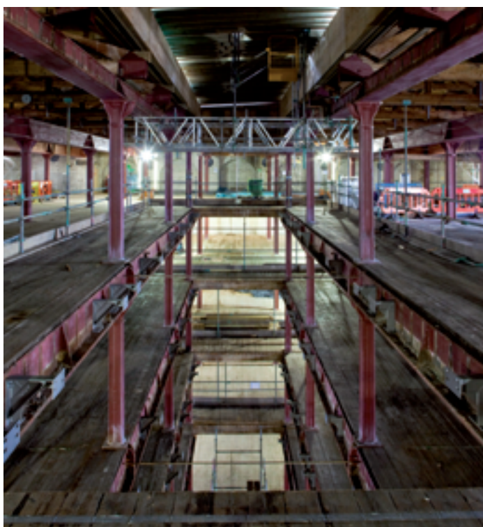
New lightwell being constructed through The Granary

The majority of the refurbishment works to The Granary are now complete, enabling installation of the new elements within the building to commence. New openings have been created within the 2nd to 5th timber floors of The Granary to create a lightwell which will allow natural light to penetrate the floorplates of the new University library and office spaces. With the new openings complete, installation of the structural steel work and glazing is now well underway. New views up to the historic pulley structure are now visible, with the completion of the new glazed roof light at 5th floor level.