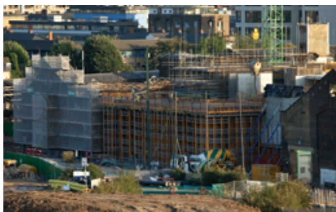
Construction work to the new Theatre and the Eastern Transit Shed

With the erection of the structural steel portal frame almost complete in the Western Transit Shed, installation of the new roof finishes will also be commencing shortly.