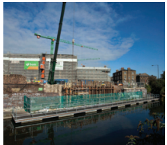
Work on the abutments for the new road bridge

The bridge was designed by Knight Architects, whose other projects include Gateshead's Millennium Bridge and Pier 6 Airbridge at Gatwick Airport.