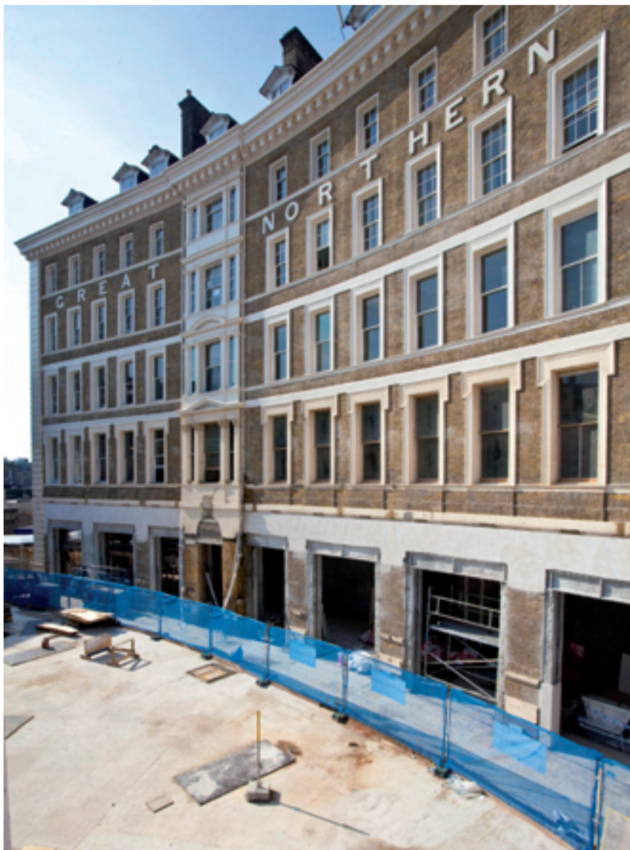
The restored concave façade and new arcade at ground floor

We are pleased to announce that Kier's construction work to the Great Northern Hotel Arcade is nearly complete. Although the pedestrian arcade will not become operational until the new concourse for King's Cross station is completed, the construction team are extremely pleased with the quality that has been achieved and look forward to having its doors open to the public.