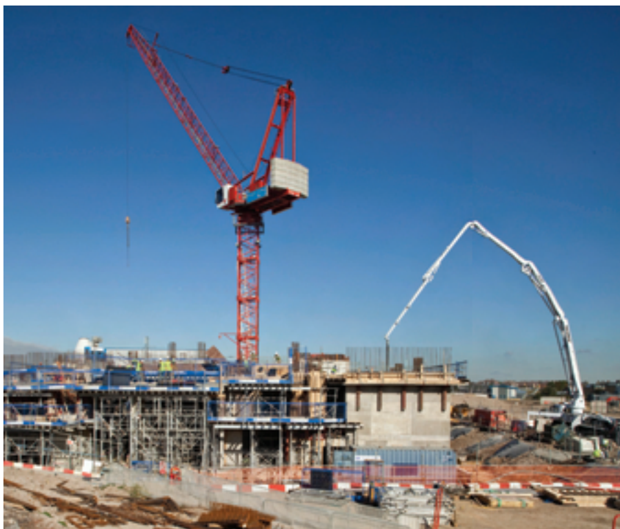
Pumping concrete into the new Energy Centre's floors

The Energy Centre and Primary Electrical Substation shell is progressing well in the north western part of the site. This is the first construction phase of Building T1.