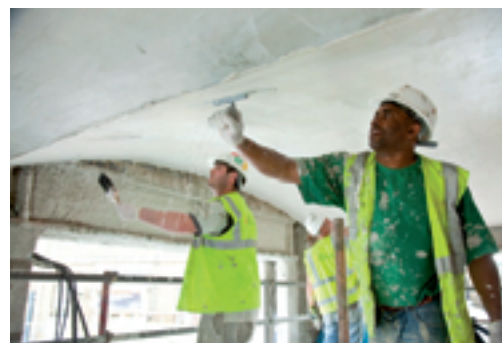
Applying final finishes to the vaulted ceiling

This work will create a 90 bedroom boutique hotel of exemplar quality, restoring the station hotel to its former glory. The intention is to open in Spring 2012, in good time for the London 2012 Olympics.